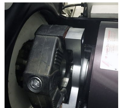
A flexible coupling dampens the torsional vibrations between the Scania 405 and the Logan SPF 1000 Series