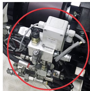
A Logan SoftStart Manifold smoothly engages the Logan SPF 1000 Series PTO clutch at 320 psi of hydraulic pressure, transmitting up to 1600 lb ft of torque