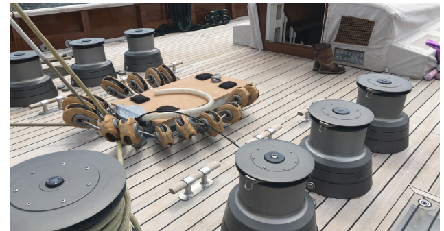
Logan SPF 1000 Series PTO clutches supply on-demand power from Scania 405 engines to the Hawe V30E hydraulic pumps that power these deck winches