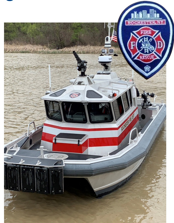
Front view of the Marine 1 – Leonard E. Redon

A Logan 600 Series Power Take-off (PTO) Clutch, is attached to the front of one of the Cummins QSB 6.7L 425 hp engines via a Logan Front Mount PTO Kit. Logan designed the bracket for the Cummins QSB 6.7, by collaborating with the Cummins engineers in Charleston, South Carolina. Logan also produced a solid model, and conducted a finite element analysis (FEA), using data supplied by Cummins. The clutch is pneumatically actuated at 120 psi. via a 24VDC switch with Logan Softstart for smooth engagement.