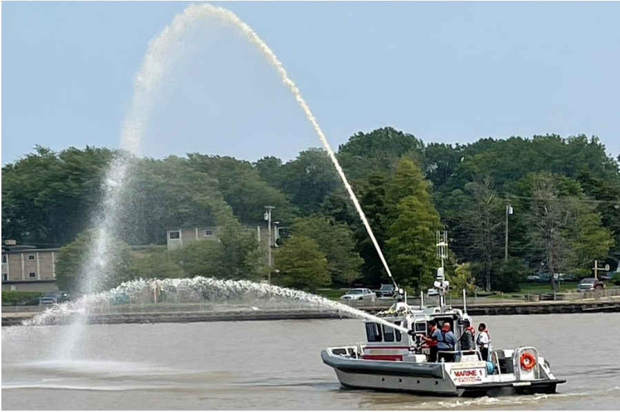
Marine 1 – Leonard E. Redon showing off its fire-fighting pump capabilities