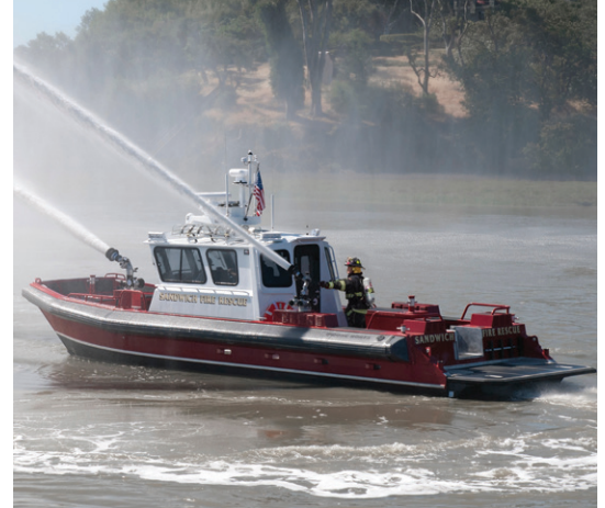
The Sandwich Fire and Rescue boat displaying the outstanding fire-fighting flow of the Logan PTO.