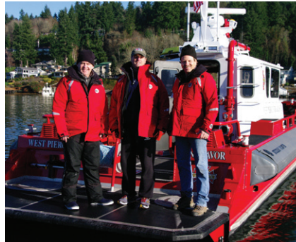
West Pierce Fire and Rescue crew onboard their vessel.

The Logan PTO installed is the SAE PTO 600—a low-profile, compact design suitable for workboats, fishing boats and pleasure craft. During maneuvering, the Logan PTO can be used as a separate power source for bow and stern thrusters. It can also directly connect to a pump