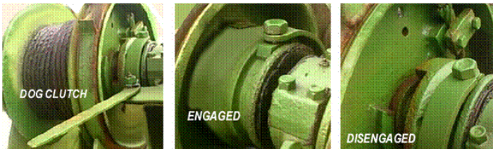
Mechanical dog-clutch replaced by hydraulically actuated Logan CH clutch.