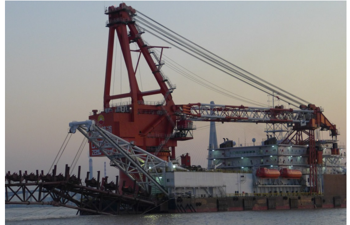
Pipe laying barge

With the use of Logan CH Clutch, the winch has a better safety feature – since the winch can be engaged and disengaged at any position and speed during normal operations or in an emergency. Unlike a Jaw or dog-type clutch which requires an operator to manually and mechanically jog the winch to disengage it.